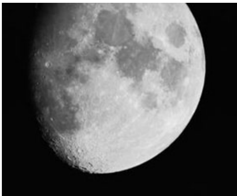
A distinctly not-extreme photo of the moon, October 3, 2003 – ASA 800 film with a Canon AE-1 attached to the rear cell of a Meade 10" LX-200.

Lick Observatory and the Center for Adaptive Optics are at the forefront of the field in designing and applying AO systems and techniques to astronomy. Dr. Gates will describe the Laser Guide Star Adaptive Optics system at Lick Observatory, as well as some of the current astronomical AO research results from the Shane 3-meter telescope.