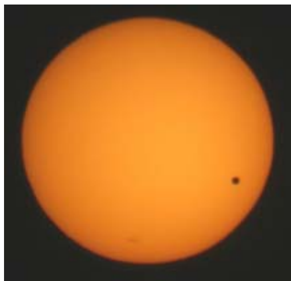
Before this day, June 8, 2004, no human alive has ever seen a Transit of the planet Venus. Not since 122 years ago on December 6, 1882 has the planet Venus crossed the face of our sun.