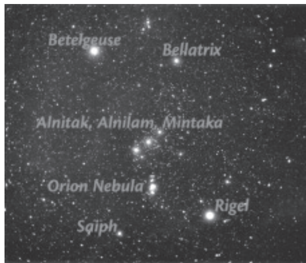
a five minute exposure on film through a small scope. Labels by the author.

The stars of Orion's belt are, from left to right, Alnitak, Alnilam and Mintaka. The three stars are similar. They are all blue-white giants that will eventually supernova. They appear to be nearly equal in magnitude so the intrinsically brightest would have to be the one furthest away. That would be Alnilam around 1300 light years distant. Alnitak is 870 light years away and Mintaka is 915 light years distant. All of these stars