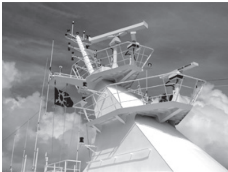
The ship puts out the eclipse success flag after viewing the total eclipse.

I have been asked in the past why go to more than one eclipse. There were a lot of "eclipse virgins" on this trip. Anyone