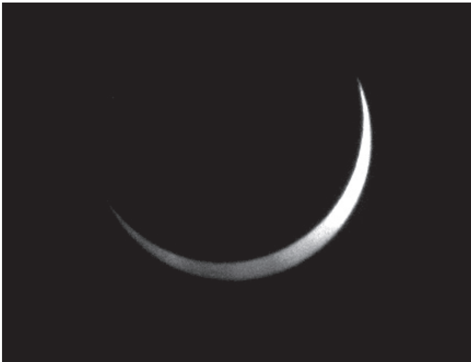
This photo is taken shortly before totality. Clouds were prevalent all day and just started to clear when this photo was taken.

almost the same size. That almost was important for this eclipse. The moon's orbit is not a circle. If the moon is further from the earth an annular eclipse