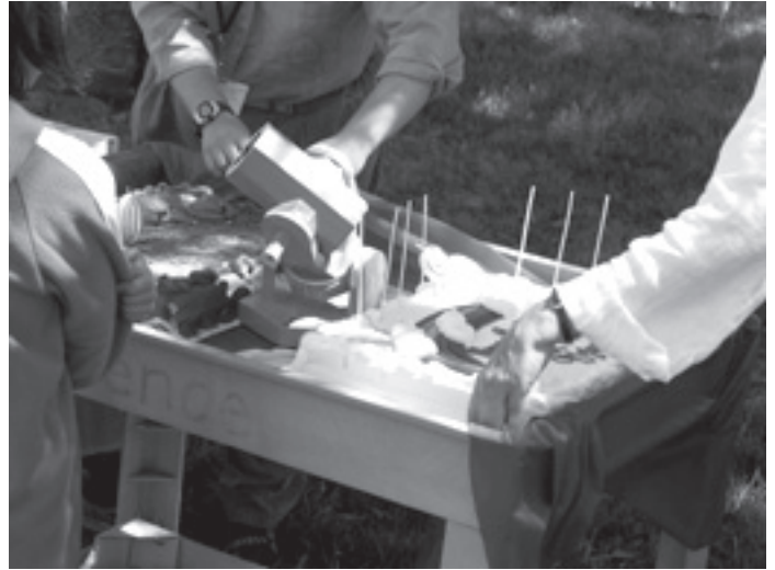
Dobsonian Cake – It wouldn't be a birthday party without cake although John Dobson says he never eats cake.

It was an unusually clear, sunny day in San Francisco, perfect for observing through solar scopes as part of the Astronomical Association of Northern California's 2005 conference at the Randall Museum on Saturday, August 27th. Over 100 people gathered to celebrate the 90th birthday of John Dobson, co-founder of The Sidewalk Astronomers, teacher, and best known for designing and constructing the "Dobsonian" mount.