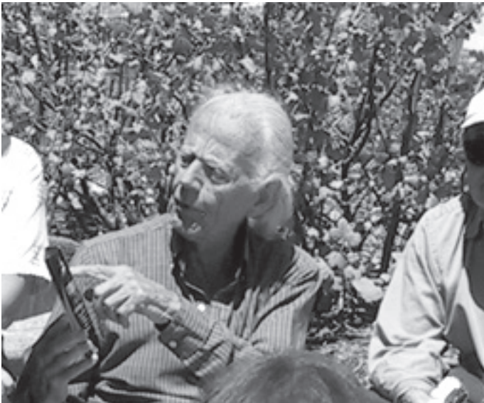
I know what that is - John Dobson makes a point about a plaque that he's just been given.