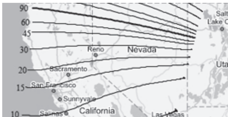
This graphic shows the maximum elevation for viewing the Stardust reentry. The background map is supplied by Google maps. Other information from Marek Kozubal and Ron Dantowitz from Clay Center Observatory.

The Re-Entry will be visible thru the western states. The capsule is predicted to reach a peak magnitude of -7, but the brightness is dependent on the distance from the capsule and the viewing angle. The capsule is brightest on its leading edge, and will quickly dim as it passes you since the capsule itself will eclipse the heat shield. From here in San Jose, the max altitude will only be 12 degrees above the horizon, and visible only for the beginning of the re-entry, before it reaches peak brightness. You will need to get high in the Diablo range with a clear Northern horizon to have any chance to view it during these winter months. To have a better view, you need to go further to the northeast. The best opportunities for viewing the re-entry will be along Highway 80 between Carlin, Nev., and Elko, Nev., and further east to the Utah border, where the capsule's front side can be observed before it passes over the observer on the ground. It is also possible to position yourself so that the capsule will pass in front of the moon! Amateur astronomers are encouraged to submit photographic, video or other data. Check http://reentry.arc.nasa.gov for more information and the SJAA website for star field plots.