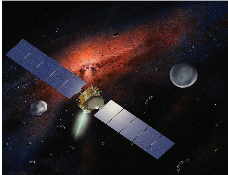
Artist's rendering of Dawn spacecraft, with asteroids. Largest are Vesta and Ceres.

Program validated technologies and how they are being used in science missions at http://nmp/TECHNOLOGY/infusion.html . While you're there, you can also download "Professor Starr's Dream Trip," a storybook for grown-ups about how ion propulsion enabled a scientist's dream of visiting the asteroids come true. A simpler children's version is available at http://spaceplace.nasa.gov/en/kids/nmp/starr .