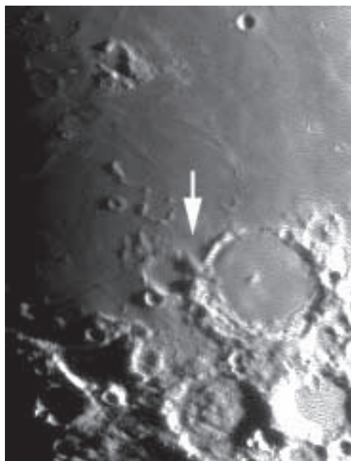
Image of the hesiodus ray

Hesiodus is a crater 28 miles in diameter to the west of Pitatus, with a pass into the latter and with gaps in its north wall. Pitatus is a magnificent lagoon-like ring, 50 miles in diameter, on the southern shore of Mare Nubium. The light of the rising Sun shines westward through the two crater's