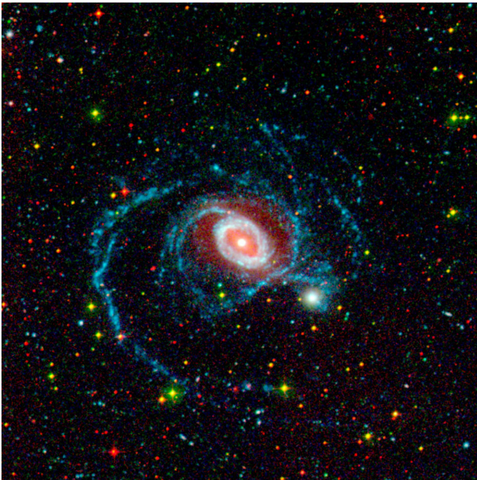
In this image of galaxy NGC 1512, red represents its visible light appearance, the glow coming from older stars, while the bluish-white ring and the long blue spiral arms show the galaxy as the Galaxy Evolution Explorer sees it in ultraviolet, tracing primarily younger stars. (Credit: NASA/JPL-Caltech/DSS/GALEX).

This article was provided by the Jet Propulsion Laboratory, California Institute of Technology, under a contract with the National Aeronautics and Space Administration.