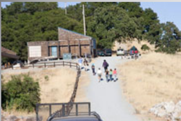
Fremont Peak Observatory

All photographs and captions courtesy of Morris "Mojo" Jones.