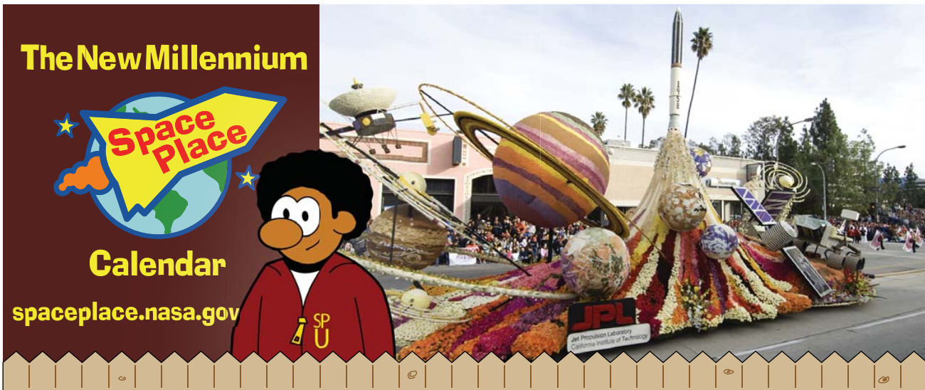
This Jet Propulsion Laboratory/Caltech float was in the 2008 Rose Parade in Pasadena, California. It celebrates "50 Years of Space Exploration." The "rocket" is launching Explorer 1 on January 31, 1958, America's first satellite to reach Earth orbit. Also see spaceplace.nasa.gov/en/kids/float .