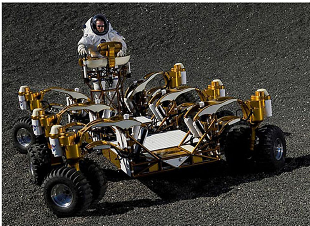
The Chariot Lunar Truck is one idea for a vehicle equal to the lunar terrain. Each of the six wheels pivot in any direction, and two turrets allow the astronauts to rotate 360°.

This article was provided by the Jet Propulsion Laboratory, California Institute of Technology, under a contract with the National Aeronautics and Space Administration.