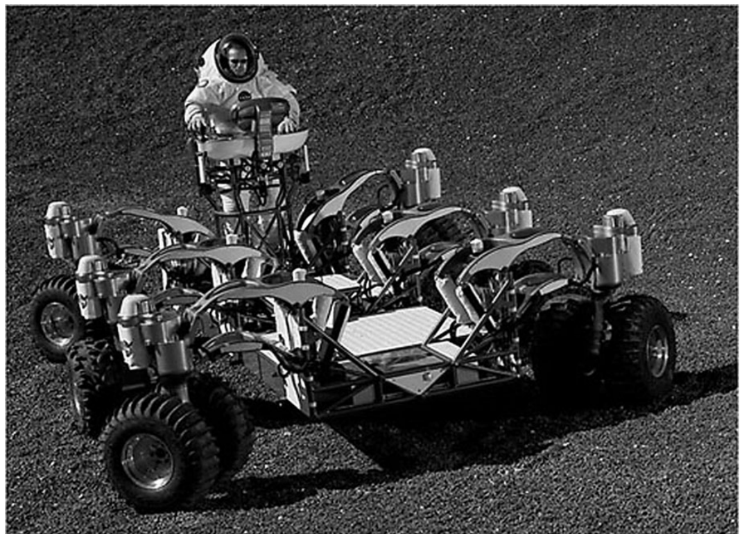
The Chariot Lunar Truck is one idea for a vehicle equal to the lunar terrain. Each of the six wheels pivot in any direction, and two turrets allow the astronauts to rotate 360°.

This article was provided by the Jet Propulsion Laboratory, California Institute of Technology, under a contract with the National Aeronautics and Space Administration.