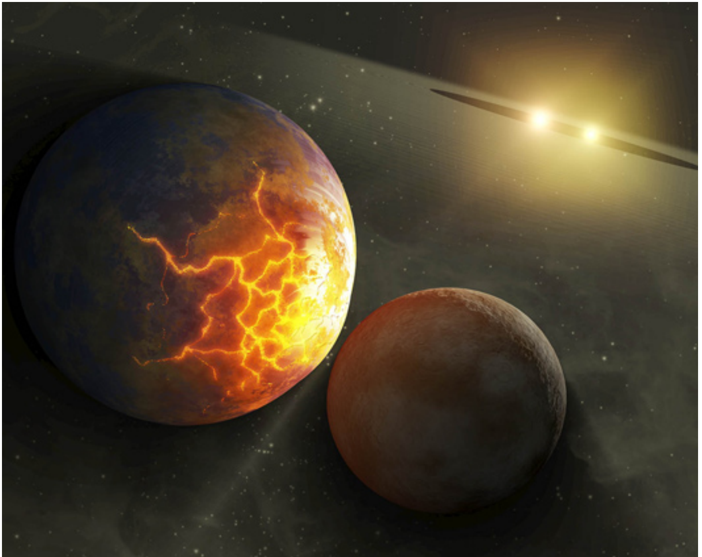
Planetary collisions such as shown in this artist's rendering could be quite common in binary star systems where the stars are very close.

Our Sun, about 864,000 miles across, rotates on its axis once in 24.5 days.