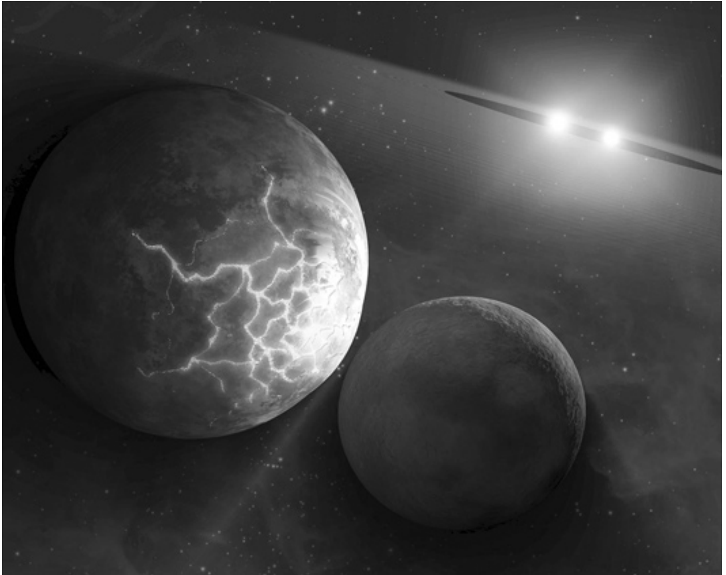
Planetary collisions such as shown in this artist's rendering could be quite common in binary star systems where the stars are very close.

Our Sun, about 864,000 miles across, rotates on its axis once in 24.5 days.