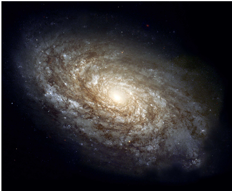
This Hubble Space Telescope image of Galaxy NGC 4414 was used to help calculate the expansion rate of the universe. The galaxy is about 60 million light-years away.

To try to explain the paradox, some 19th century scientists thought that dust clouds between the stars must be absorbing a lot of the starlight so it wouldn't shine through to us. But later scientists realized that the dust itself